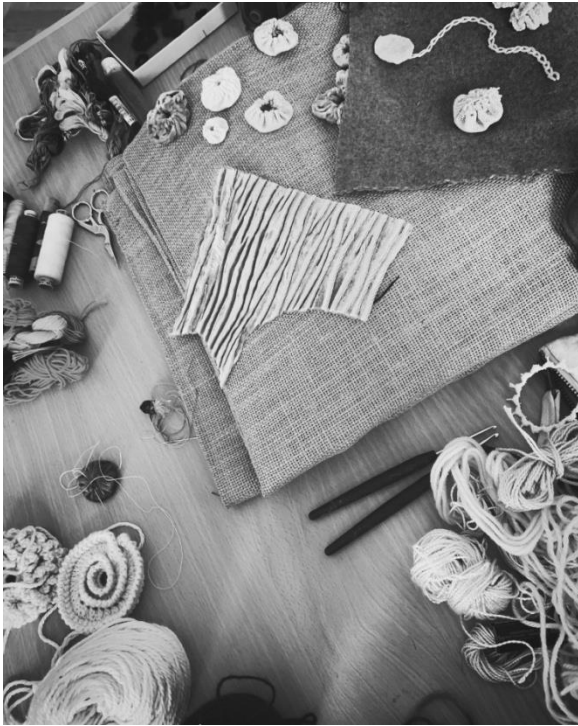
Display of workshop materials