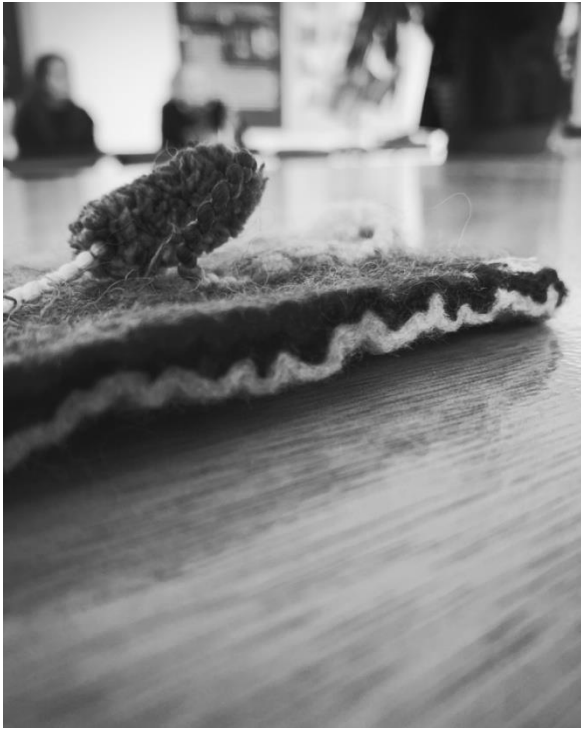
Side view that shows richness of the felt