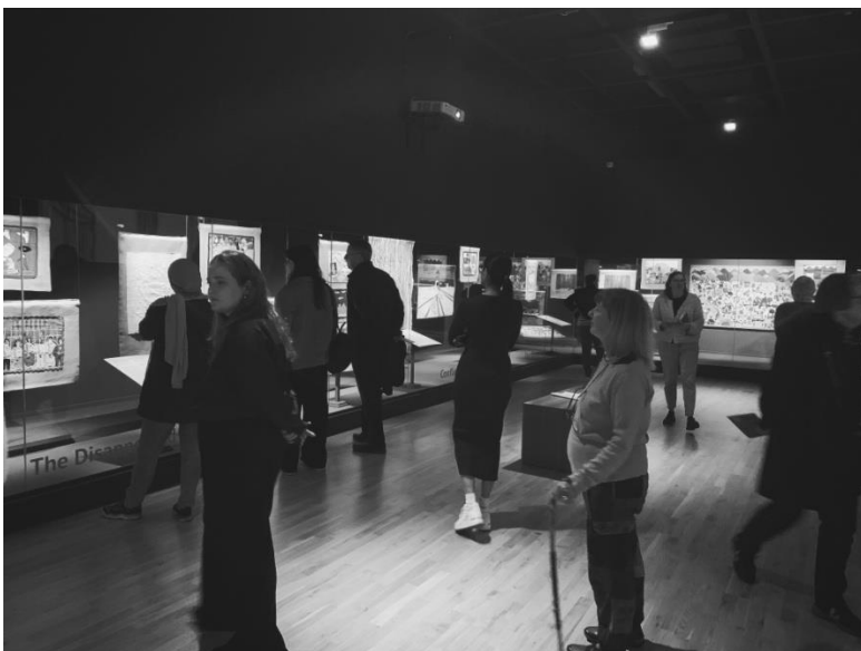
Workshop participants in Gallery 3