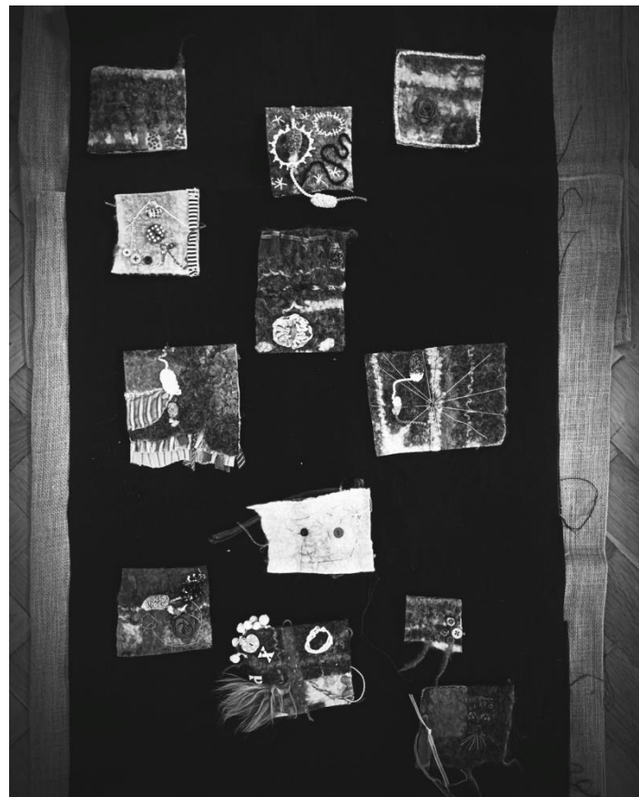
Each participant placed the sewn piece onto a temporary cloth backing and shares thought and feelings expressed through the workshop